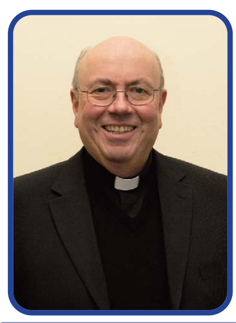
The Right Reverend Malcolm McMahon OP CFS Chairman

The CES negotiates with the Westminster and Welsh Governments and other national bodies in order to safeguard and promote Catholic education. It also offers a Catholic contribution to the English and Welsh educational landscapes, seeking to ensure that the principles of Catholic Social Teaching are reflected in all aspects of national education policy.